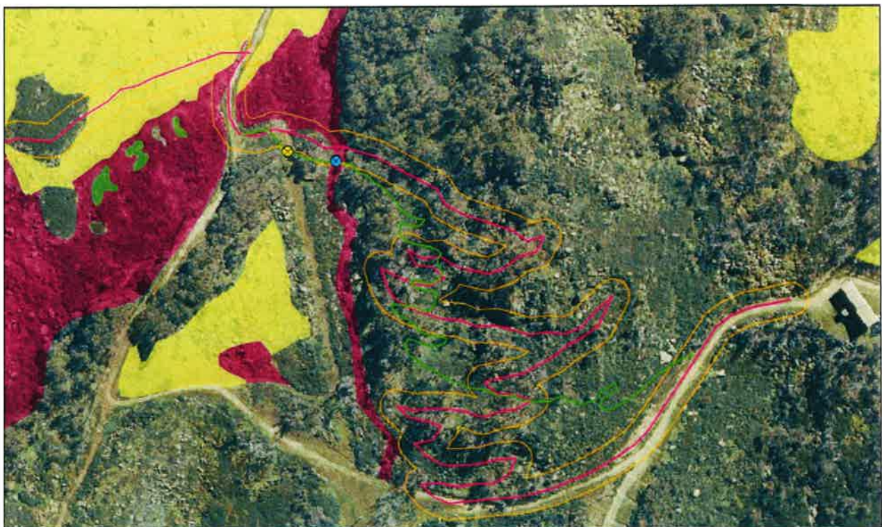
Figure 2: Proposed alignment of mountain bike trail (green line) compared with approved alignment (pink line)